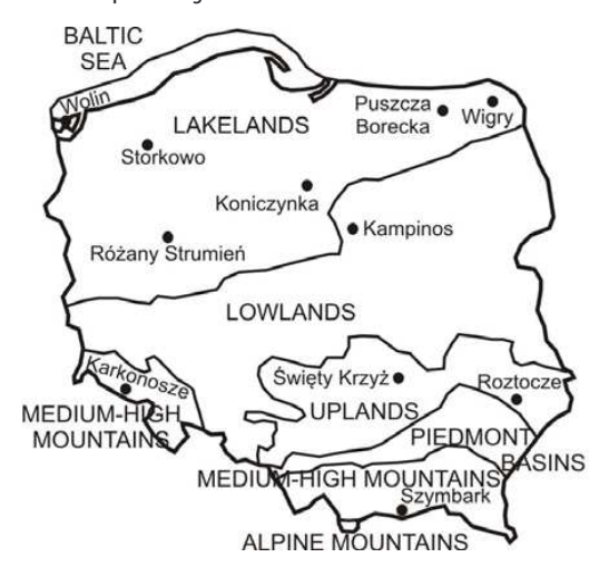
Figure 1 The location of Integrated Environmental Monitoring Programme Base Stations in landscape-ecological zones